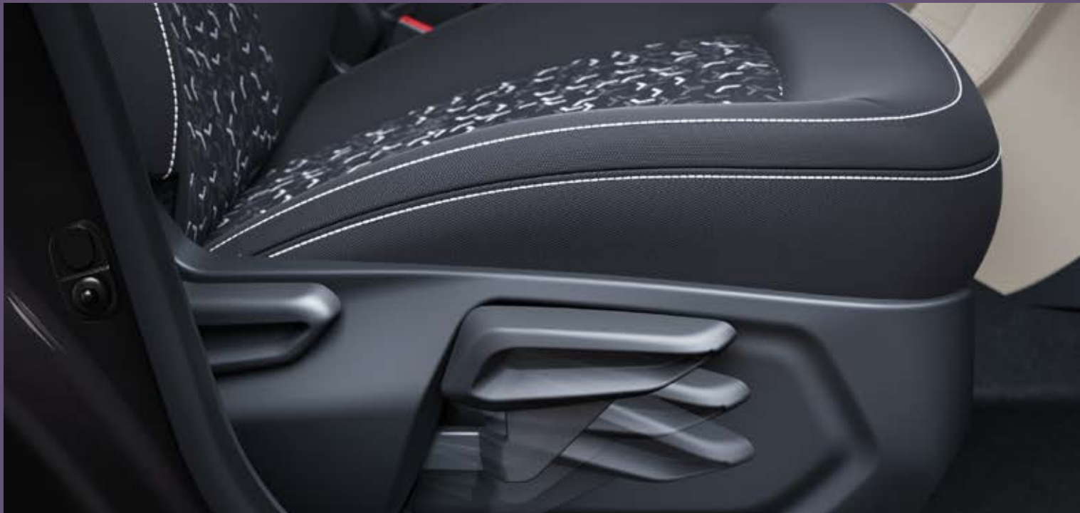
Height Adjustable Driver Seat