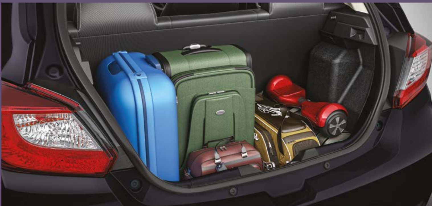
242 l Boot Space